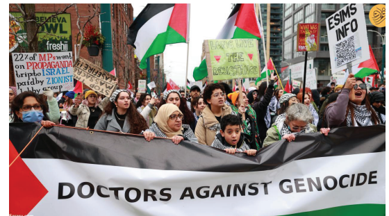
A demonstration in support of Palestine was held in Toronto, Canada. Demonstrators carrying Palestinian banners and flags gathered around the US Consulate General, protesting Israel's attacks on Gaza and calling for a ceasefire.

On al-Quds day, demonstrations are held around the world in over 80 Islamic and non-Islamic countries. Among these are Malaysia, India, Singapore, Indonesia, Turkey, the United States of America, Canada, Norway, Azerbaijan, Sudan, England, Bahrain, Bosnia, Tunisia, Pakistan, Australia, Germany, Romania, Kuwait, Spain, South Africa, Sweden, Venezuela, Albania, Yemen, and Greece.